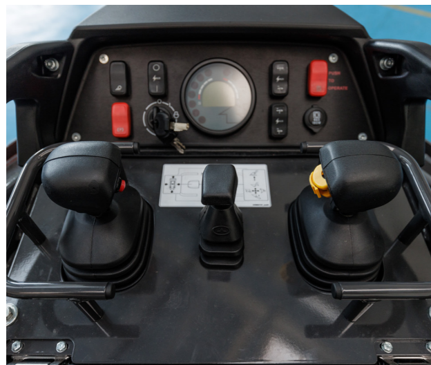
Control console with piloted hydraulic joysticks.

All equipment is activated by electrical and hydraulic controls on the control console (AUX 1 roller and optional push buttons). The front LED bar can be activated with one click from the dedicated button, while two clicks are required to activate the rear. Both provide visibility up to 25 m.