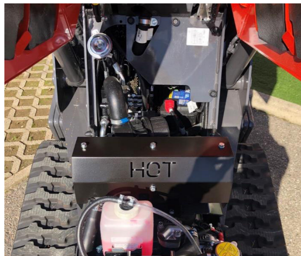
Front access to engine, air and fuel filters.

The four attachment points (2 at the front and 2 at the rear) facilitate safe transport of the machine on any type of vehicle.