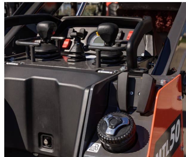
Two convenient object holders and two external support handles for added security.