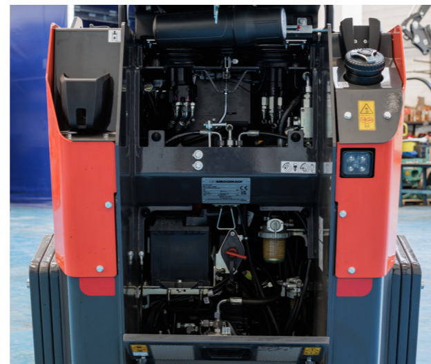
Rear access to battery and pump.